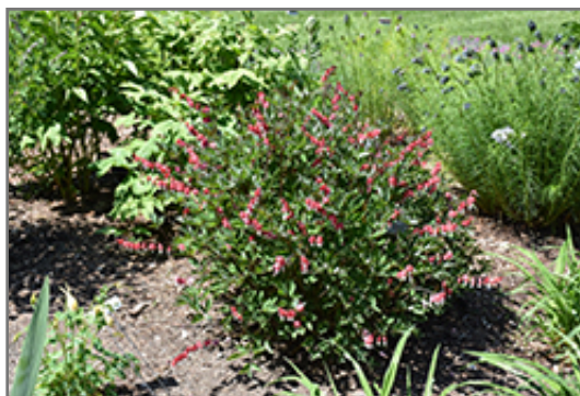
Valentine Bleeding Heart in bloom