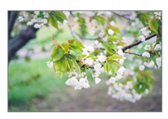
Van Cherry flowers