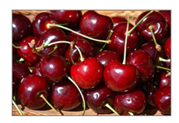
Van Cherry fruit

Van Cherry is draped in stunning clusters of fragrant white flowers hanging below the branches in early spring before the leaves. It has dark green deciduous foliage. The pointy leaves turn yellow in fall. The fruits are showy dark red drupes with deep purple overtones, which are carried in abundance in mid summer. The fruit can be messy if allowed to drop on the lawn or walkways, and may require occasional clean-up. The smooth dark red bark adds an interesting dimension to the landscape.