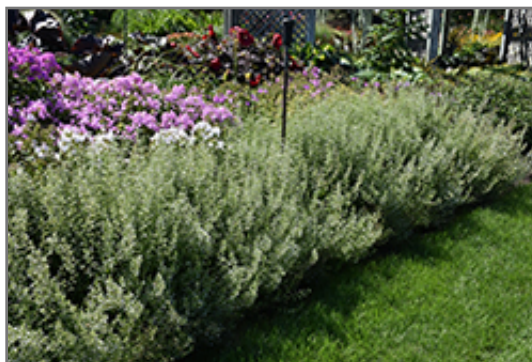
Montrose White Dwarf Calamint in bloom