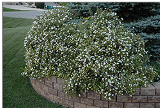
Abbotswood Potentilla in bloom