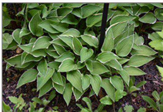
Allan P. McConnell Hosta foliage