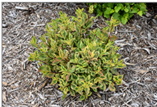
Rainbow Sensation Weigela

Rainbow Sensation Weigela makes a fine choice for the outdoor landscape, but it is also well-suited for use in outdoor pots and containers. Because of its height, it is often used as a 'thriller' in the 'spiller-thriller-filler' container combination; plant it near the center of the pot, surrounded by smaller plants and those that spill over the edges. It is even sizeable enough that it can be grown alone in a suitable container. Note that when grown in a container, it may not perform exactly as indicated on the tag - this is to be expected. Also note that when growing plants in outdoor containers and baskets, they may require more frequent waterings than they would in the yard or garden.