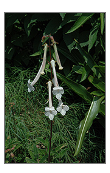
Hardy White Gloxinia flowers