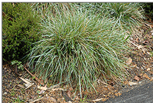
Blue Moor Grass