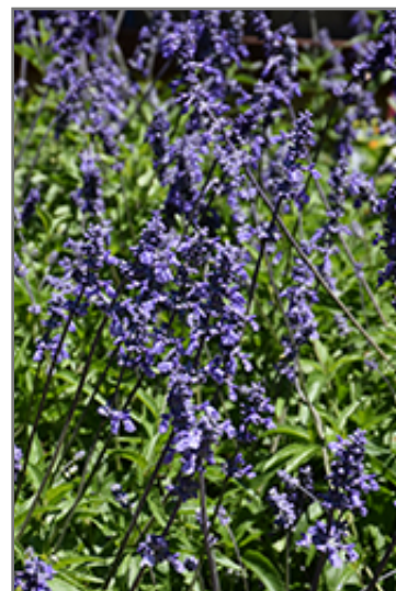
Mealy Cup Sage flowers

Mealy Cup Sage is recommended for the following landscape applications;