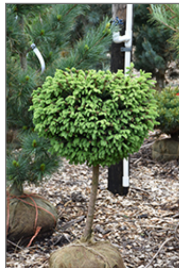
Little Gem Spruce (tree form)