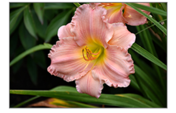
Jolyene Nichole Daylily flowers