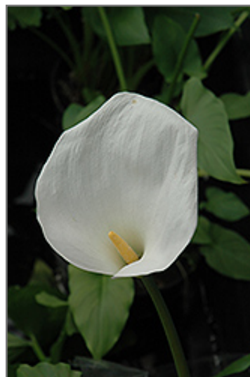
Calla Lily flowers