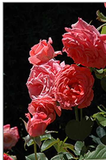
Climbing America Rose flowers