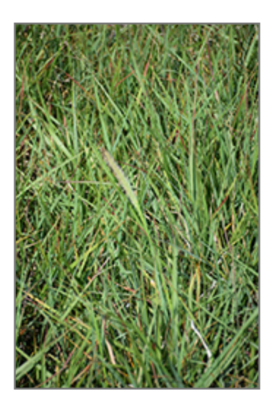
Fairy Tales Evergreen Fountain Grass foliage

Fairy Tales Evergreen Fountain Grass is recommended for the following landscape applications;