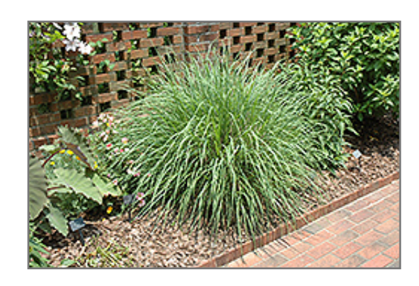
Fairy Tales Evergreen Fountain Grass

This is a relatively low maintenance plant, and is best cleaned up in early spring before it resumes active growth for the season. Deer don't particularly care for this plant and will usually leave it alone in favor of tastier treats. It has no significant negative characteristics.