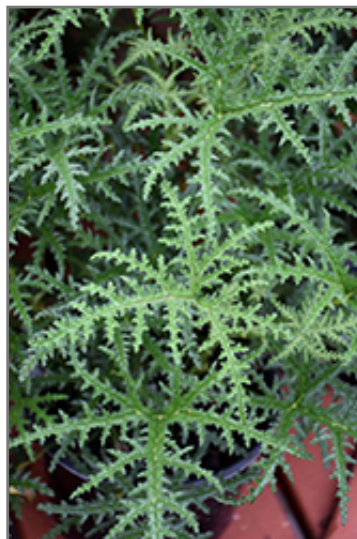
Pine Scented Geranium foliage