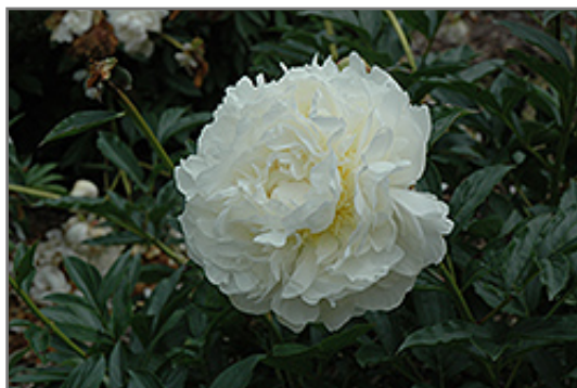
Marie Lemoine Peony flowers