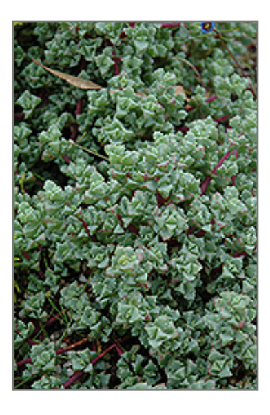
Pink Iceplant foliage

Distinct, fleshy, triangular blue-green leaves held on violet stems; leaves are bordered by small red teeth and topped with daisy-like, lavender-pink flowers; this spreading evergreen requires sandy soil; a very unique addition to the garden