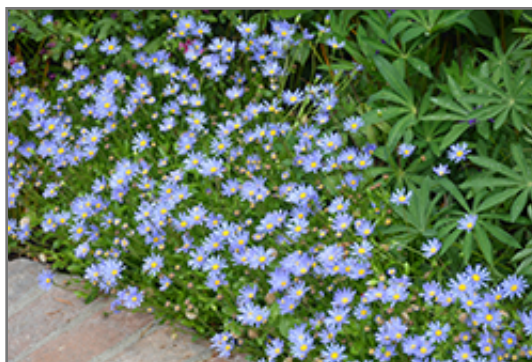
Blue Daisy in bloom