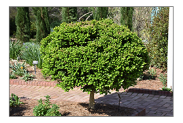
Common Boxwood (tree form)