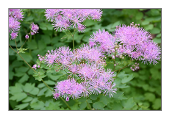
Meadow Rue flowers