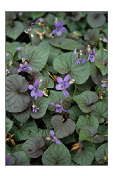
Wood Violet flowers