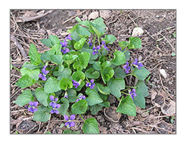
Wood Violet in bloom