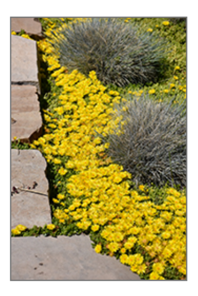
Yellow Ice Plant in bloom