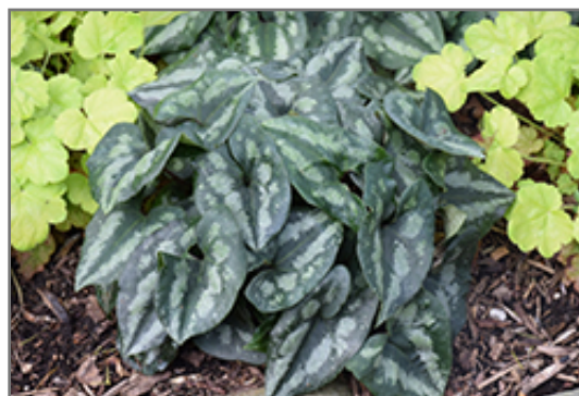
Asian Wild Ginger