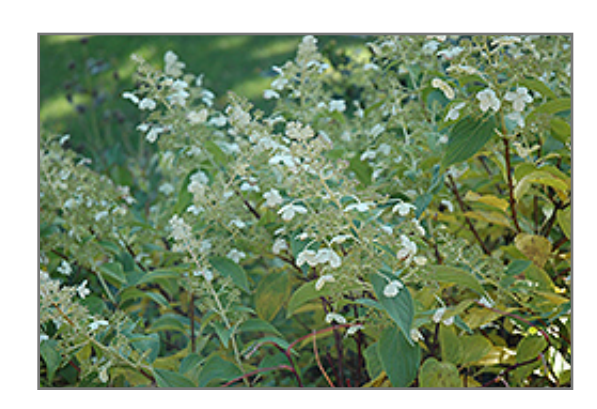
Kyushu Hydrangea flowers

A showy upright medium-sized shrub prized for its upright spires of mixed sterile and fertile white flowers in mid to late summer, blooms well in shade; somewhat coarse in appearance, regular pruning recommended, needs slightly acidic well-drained soil