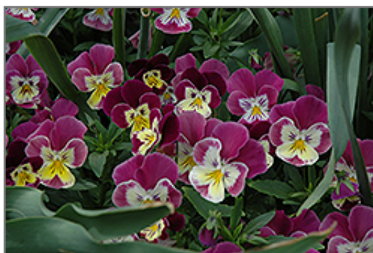
Ultima Baron Merlot Pansy flowers

Ultima Baron Merlot Pansy is recommended for the following landscape applications;