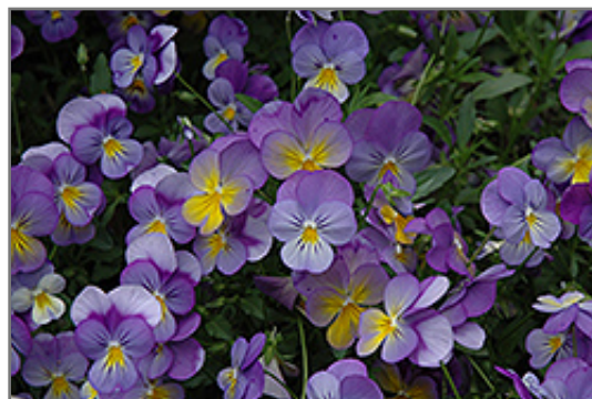
Rebel Blue and Yellow Pansy flowers

Rebel Blue and Yellow Pansy is recommended for the following landscape applications;