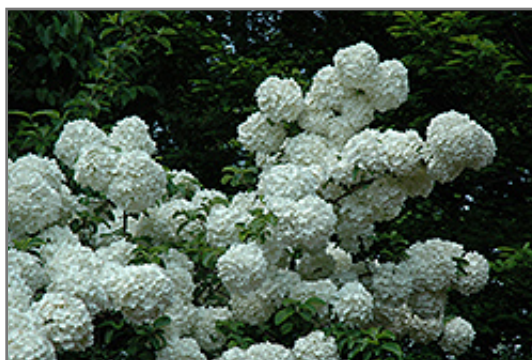
Chinese Snowball Viburnum flowers