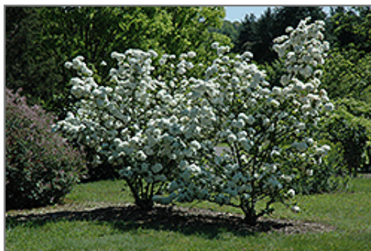
Chinese Snowball Viburnum in bloom

This shrub does best in full sun to partial shade. It is very adaptable to both dry and moist locations, and should do just fine under average home landscape conditions. It is not particular as to soil type or pH. It is highly tolerant of urban pollution and will even thrive in inner city environments. This species is not originally from North America.