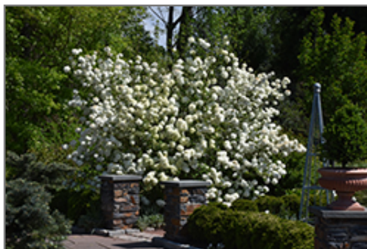
Chinese Snowball Viburnum in bloom

Chinese Snowball Viburnum is recommended for the following landscape applications;