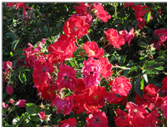
Flower Carpet Red Rose flowers

This shrub should only be grown in full sunlight. It does best in average to evenly moist conditions, but will not tolerate standing water. It is not particular as to soil type or pH. It is somewhat tolerant of urban pollution. This particular variety is an interspecific hybrid.