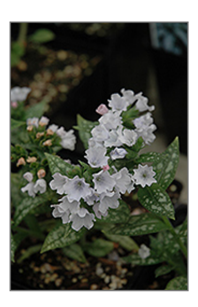
Silverado Lungwort flowers

A low mounding perennial with green, lance-shaped leaves with silver spots and pale pink flowers in spring which turn powder blue as they age; an attractive accent plant or impressive underplanting for wooded areas