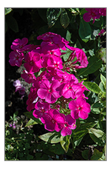
Junior Dream Garden Phlox flowers

Exceptionally long blooms of fragrant purple flowers with darker purple centres and white petal flares, on compact plants that tend to be bushier: suitable for containers or small perennial borders; good mildew resistance