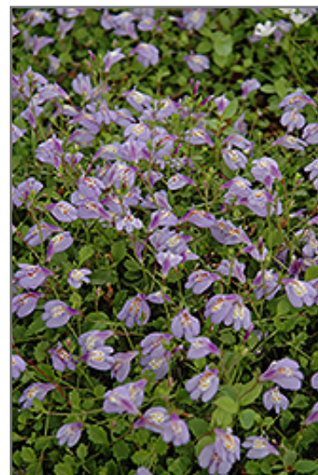
Creeping Mazus flowers

Creeping Mazus is recommended for the following landscape applications;