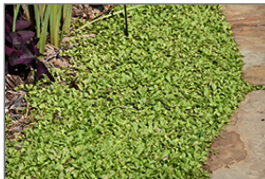
Creeping Mazus

Creeping Mazus will grow to be only 2 inches tall at maturity extending to 3 inches tall with the flowers, with a spread of 12 inches. Its foliage tends to remain low and dense right to the ground. It grows at a fast rate, and under ideal conditions can be expected to live for approximately 10 years. As an evergreen perennial, this plant will typically keep its form and foliage year-round.