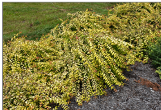
Dream Catcher Beautybush