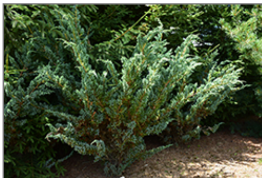
Meyer Juniper