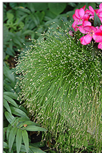
Fiber Optic Grass