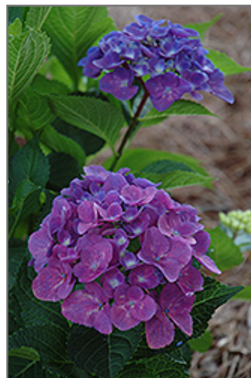
Cityline Venice Dwarf Hydrangea flowers

Cityline Venice Dwarf Hydrangea is recommended for the following landscape applications;