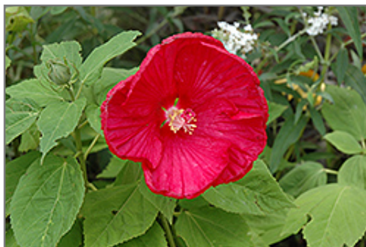
Disco Belle Rosy Red Hibiscus flowers