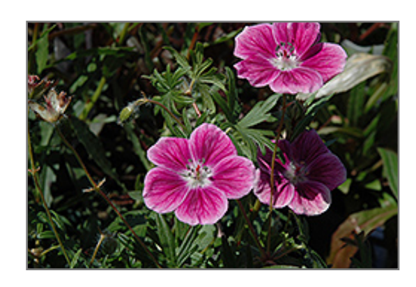
Elke Cranesbill flowers

Amazing hot pink saucer shaped blooms with white center and edges cover this low, mounded plant; deadhead spent flowers for reblooming later in the season; shows good drought tolerance