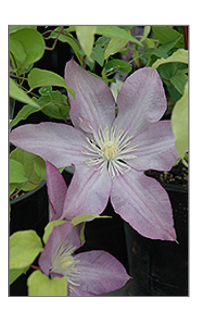
Proteus Clematis flowers

Proteus Clematis features showy lilac purple star-shaped flowers at the ends of the branches from late spring to early fall. It has green deciduous foliage. The compound leaves do not develop any appreciable fall colour.