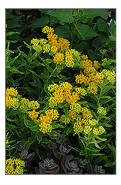
Hello Yellow Milkweed flowers

Milkweed is the most important plant to the monarch butterfly caterpillar; this variety features vibrant yellow flowers; great for dry, sunny areas; can use dried seed pods for crafts