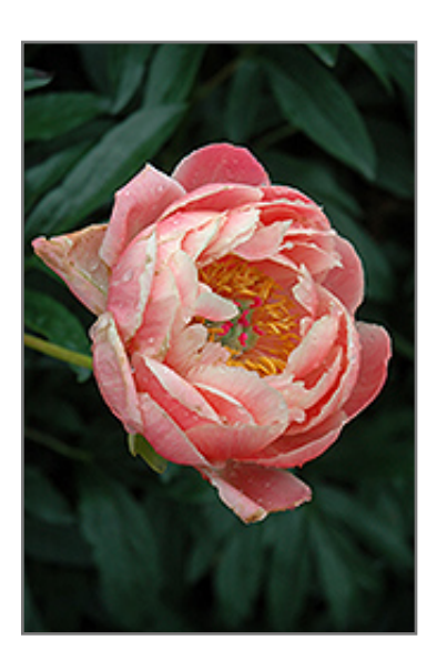
Coral Charm Peony flowers