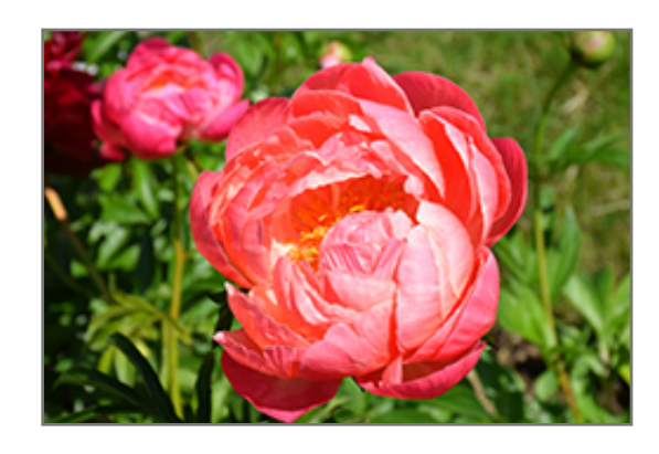
Coral Charm Peony flowers

Coral Charm Peony is recommended for the following landscape applications;