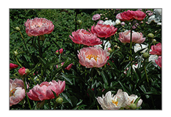
Coral Charm Peony flowers

Coral Charm Peony will grow to be about 30 inches tall at maturity, with a spread of 3 feet. When grown in masses or used as a bedding plant, individual plants should be spaced approximately 30 inches apart. The flower stalks can be weak and so it may require staking in exposed sites or excessively rich soils. It grows at a slow rate, and under ideal conditions can be expected to live for approximately 20 years. As an herbaceous perennial, this plant will usually die back to the crown each winter, and will regrow from the base each spring. Be careful not to disturb the crown in late winter when it may not be readily seen!