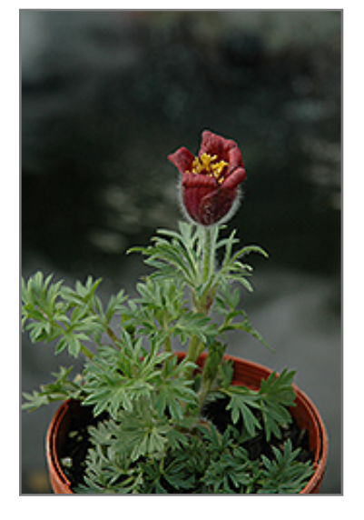
Red Bells Pasqueflower flowers