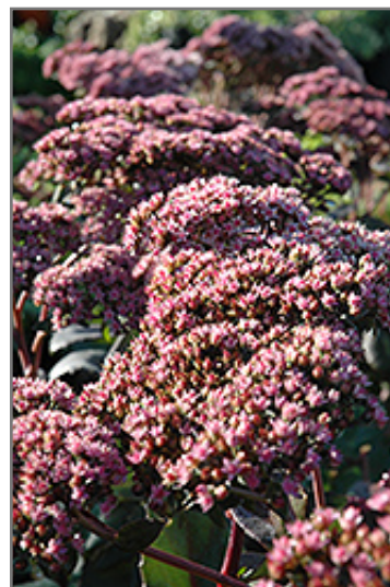
Maestro Stonecrop flowers

Maestro Stonecrop is recommended for the following landscape applications;