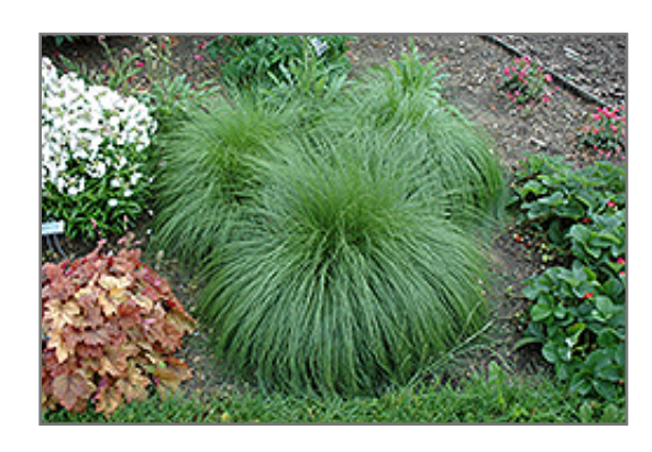
Prairie Dropseed

Prairie Dropseed is recommended for the following landscape applications;