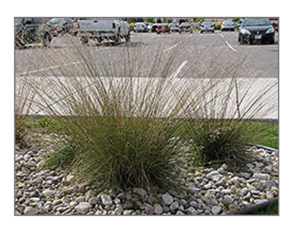
Prairie Dropseed