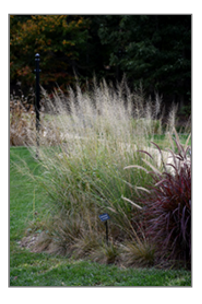
Prairie Dropseed fruit

This plant does best in full sun to partial shade. It is very adaptable to both dry and moist locations, and should do just fine under typical garden conditions. It is considered to be drought-tolerant, and thus makes an ideal choice for a low-water garden or xeriscape application. It is not particular as to soil type or pH, and is able to handle environmental salt. It is somewhat tolerant of urban pollution. This species is native to parts of North America.