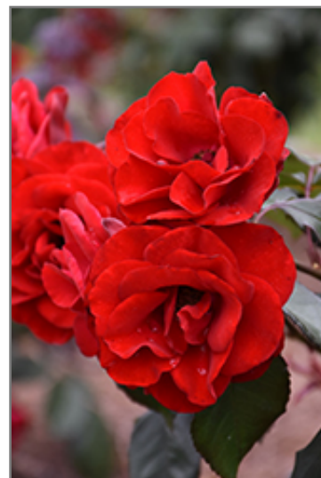
Europeana Rose flowers

The Europeana Rose is recommended for the following landscape applications;