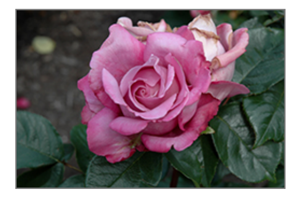
Royal Amethyst Rose flowers