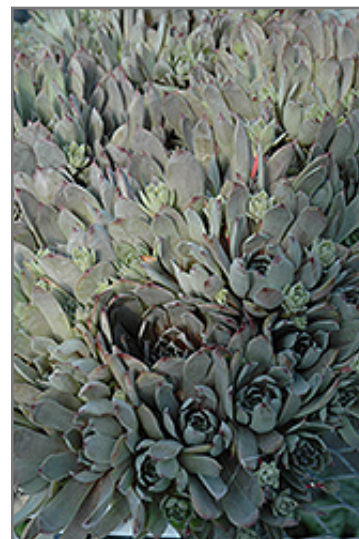
Big Blue Hens And Chicks

Big Blue Hens And Chicks is recommended for the following landscape applications;