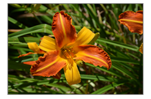
Frans Hals Daylily flowers