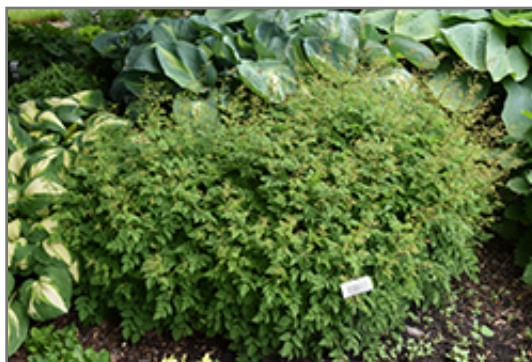
Misty Lace Goatsbeard

This plant does best in full sun to partial shade. It is quite adaptable, preferring to grow in average to wet conditions, and will even tolerate some standing water. It is not particular as to soil pH, but grows best in rich soils. It is somewhat tolerant of urban pollution. Consider applying a thick mulch around the root zone over the growing season to conserve soil moisture. This particular variety is an interspecific hybrid. It can be propagated by division; however, as a cultivated variety, be aware that it may be subject to certain restrictions or prohibitions on propagation.