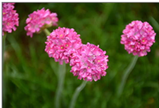
Bloodstone Sea Thrift flowers

Bloodstone Sea Thrift will grow to be only 6 inches tall at maturity extending to 10 inches tall with the flowers, with a spread of 18 inches. Its foliage tends to remain low and dense right to the ground. It grows at a slow rate, and under ideal conditions can be expected to live for approximately 10 years. As an evergreen perennial, this plant will typically keep its form and foliage year-round.