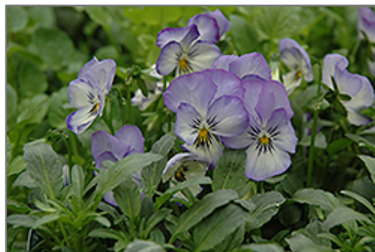
Coconut Swirl Sorbet Pansy flowers